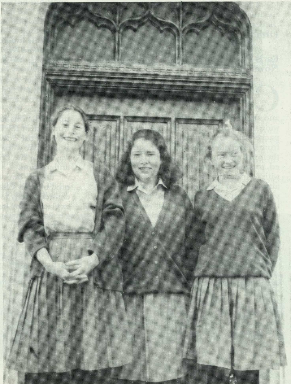
The Public Speaking Team