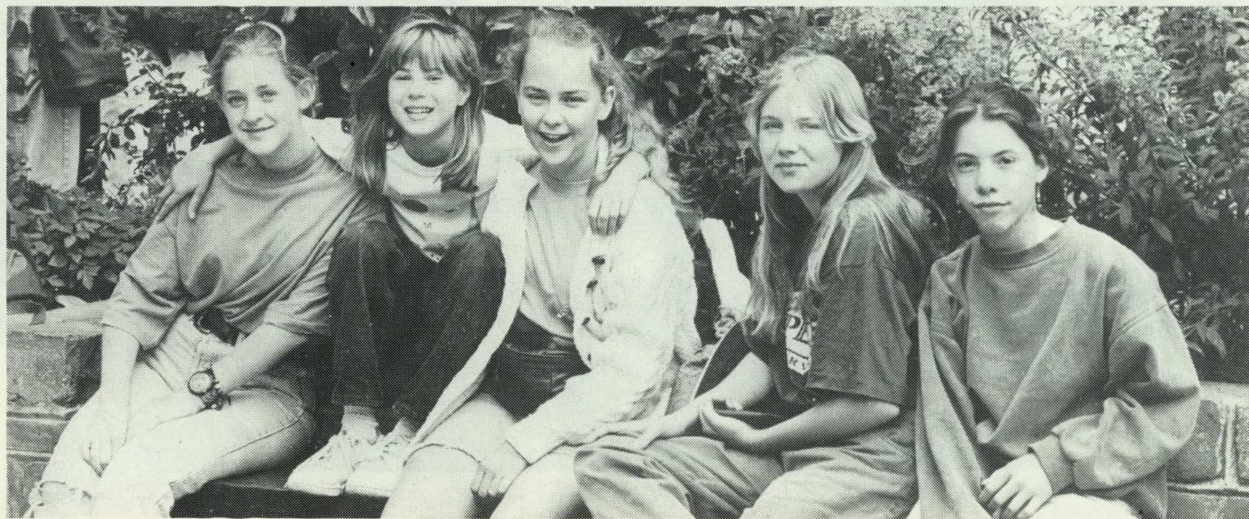
Third formers in Dieppe, Summer 1992.