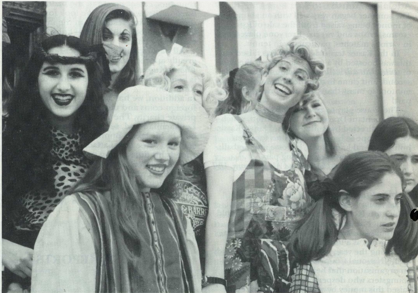
Mufti Day, 1992.