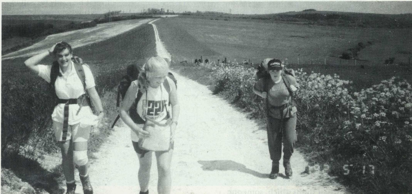
On the South Downs Way