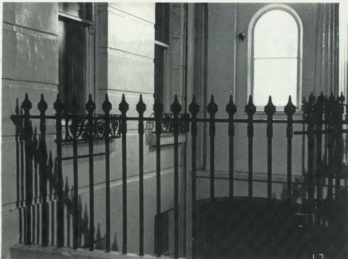
Night time in Lewes Crescent (Photographic Society)

For the last nine years the school darkroom has been situated in the art building and this had some disadvantages, not the least being that as a north-facing room it was difficult to use in cold weather. The low ambient temperature were not only uncomfortable for those using the room but there were difficulties in keeping the developing and acid fixing baths at the required temperature of 20°C.