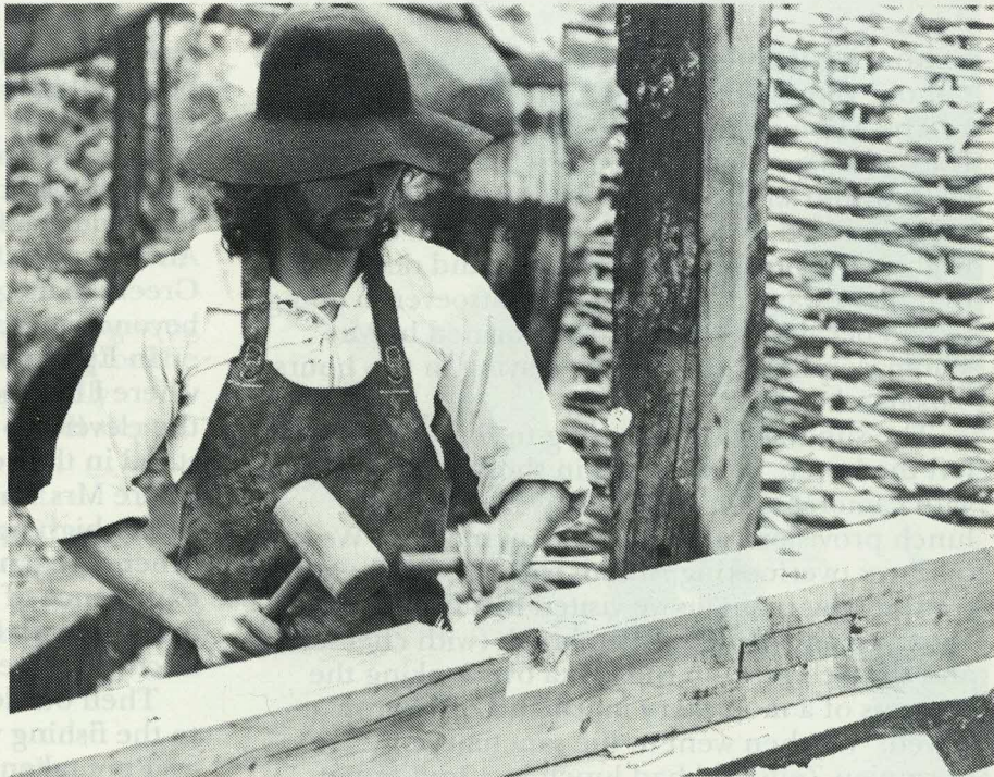
In the 17th Century village of Little Woodham

Another funny incident that happened outside the inn was this: a group of people in my class were sitting quietly on a bench outside waiting for everyone else to finish looking inside when along came a local villager. He was singing joyfully; he then started to chat to us, but he took a fancy to one particular girl and took her by the hand,