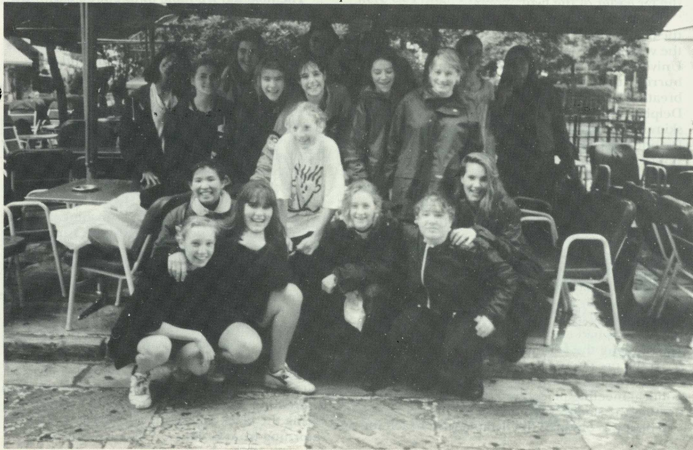
On the 1992 expedition to Greece