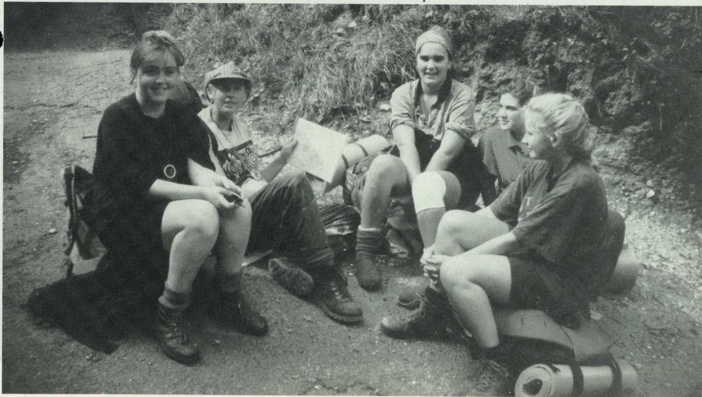
Don't blame me - blame the map!