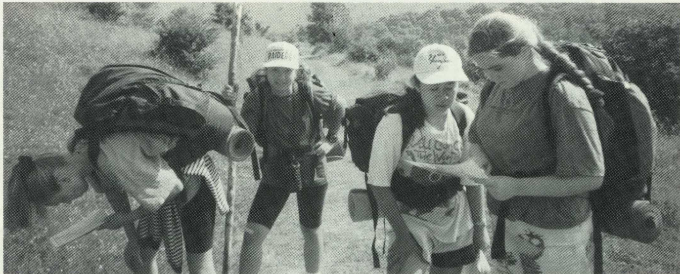
Or was it the other way?

ahead of us as the clouds in the north-west looked like rain and yesterday we didn't get a drop of rain. So at 8:30 am our group once again started off on the final stretch of our walk together with the other two groups, as it could be dangerous walking along the coast line since there were only two feet of path between an electric fence and a sheer drop of 150 feet.