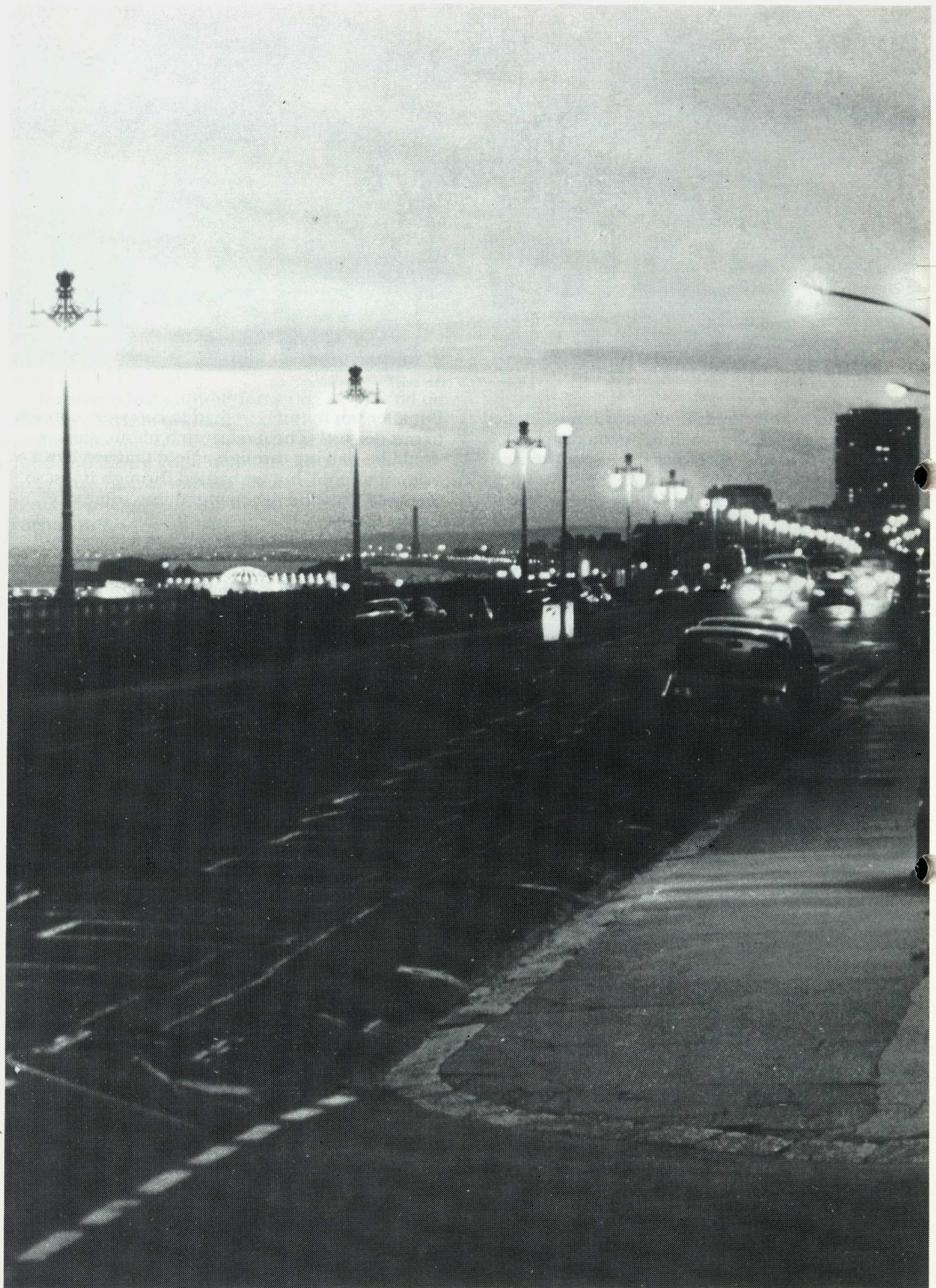
Marine Parade, Brighton