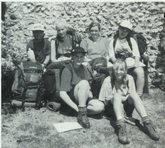
Ready to go